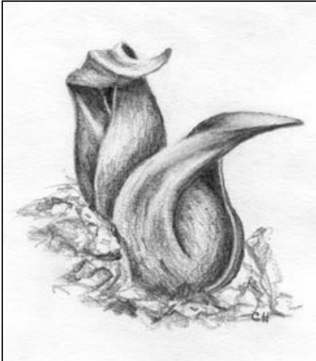
Figure 2. Skunk cabbage spathes.