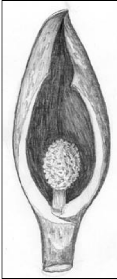
Figure 3. Shunk cabbage spathe; the front part has been cut off to show the flower head (spadix).