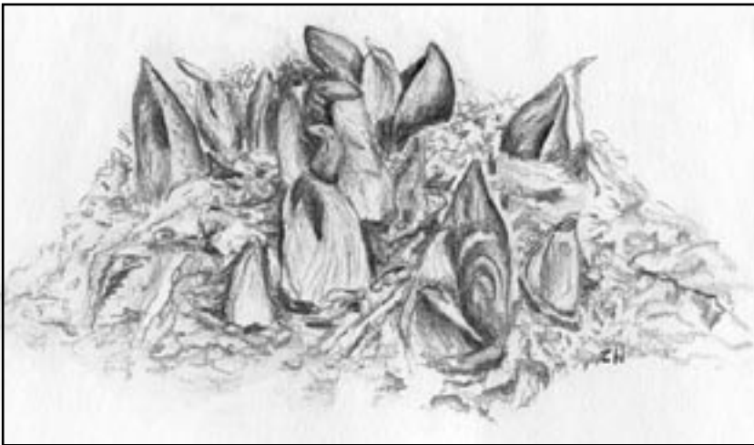
Figure 1. A group of skunk cabbage spathes and leaf buds in March.

The hood is, in botanical terms, a highly modified leaf called a spathe. The spathe wraps around itself to form a space that encloses a spherical head of flowers, called a spadix (see figure 2). The spathe functions as a bud that holds and protects the flower head when it emerges out of the ground. But it is a bud that never unfolds. When the flowers are full in bloom, they are